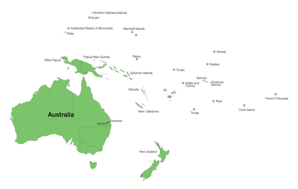
Figure 2. Location of the Islands present in Oceania and the Pacific referred to in this review.

In Australia, LF has been recorded historically along the eastern coast, extending from the Northern Rivers area of New South Wales to Far North Queensland and the islands of the Torres Strait (Figure 2). A focus was recorded for Brisbane, the capital city of the state of Queensland, where Bancroft practiced medicine [7]. Autochthonous cases have not been described since 1956 [8] in Australia, but returned travelers and service personnel, as well as immigrants and refugees, are a potential source of LF [6,9]. Our closest Pacific neighbours, Papua New Guinea (PNG) and Indonesia, remain endemic and could be the source of potential new cases and new invasive mosquito species capable of transmitting the disease.