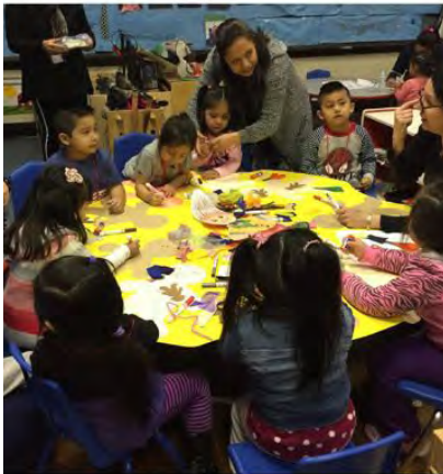
Above: Children and families from Puentes de Salud gain creative connections at the Barnes, through Puentes a las Artes/Bridges to the Arts project.