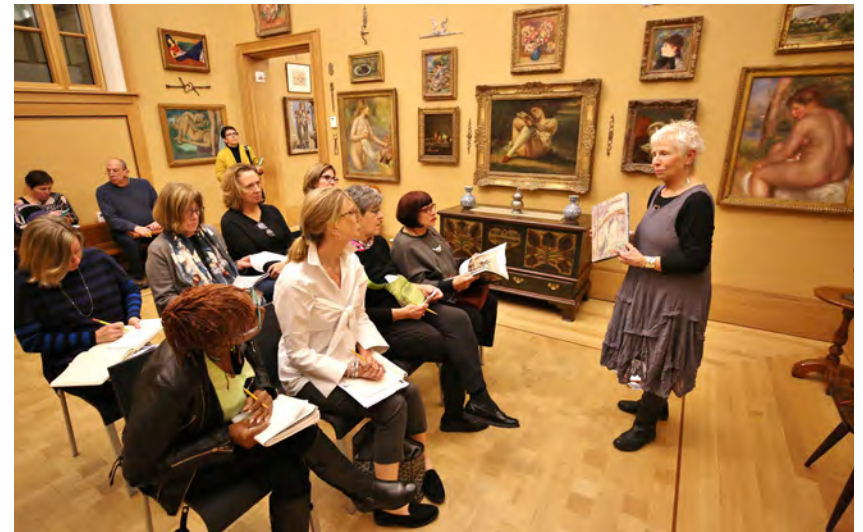
Class taking place in the Barnes collection gallery