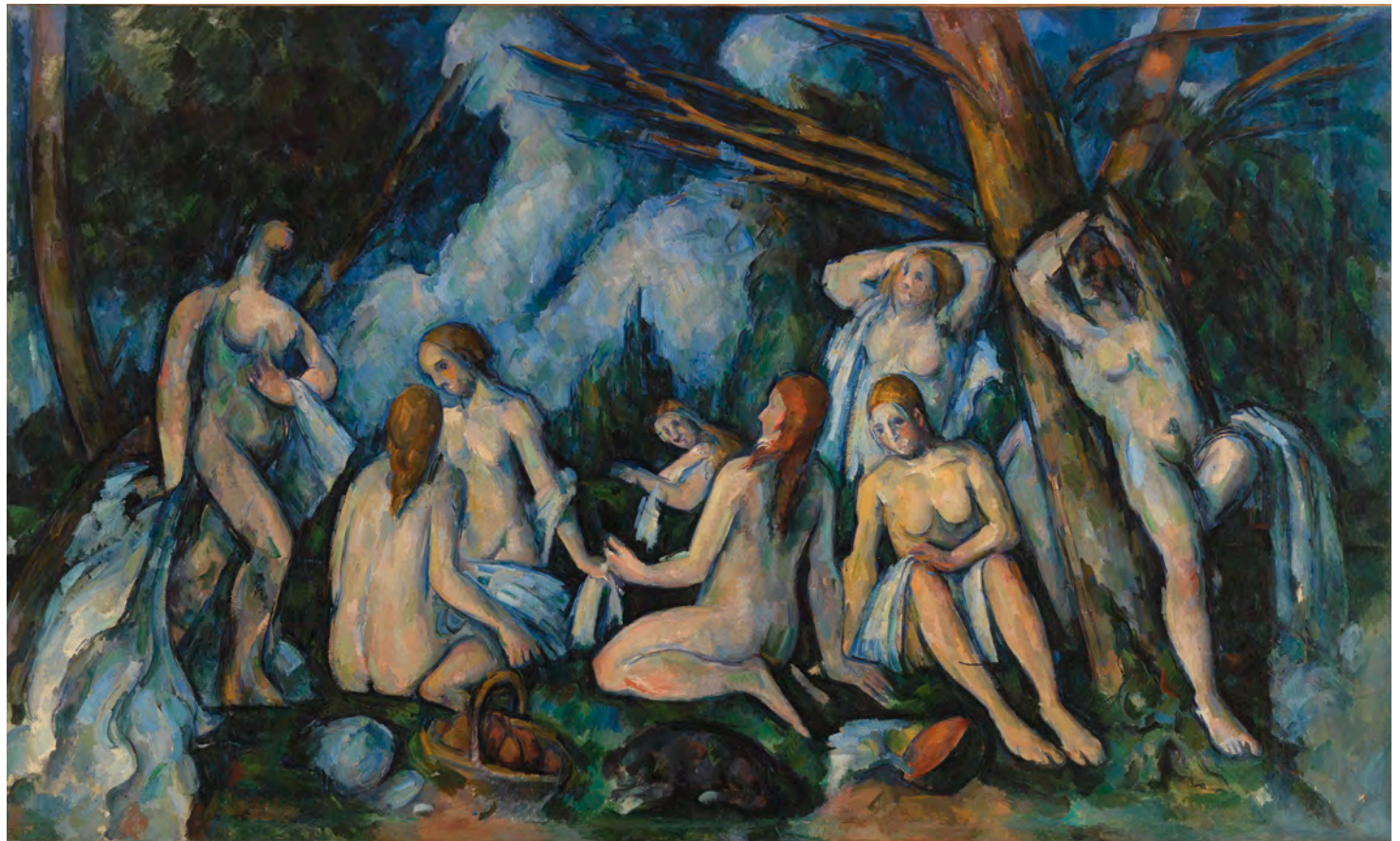
Paul Cézanne. The Large Bathers , 1895–1906 X-ray of same image.