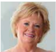
Donna Van Eekeren Foundation