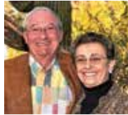
Rhoda and Henry Frank Foundation