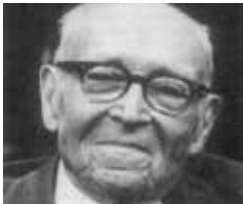
Julius Frankel Foundation

GRAMMA FISHER FOUNDATION OF MARSHALLTOWN, IOWA