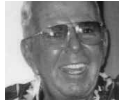
John R. Halligan Charitable Fund