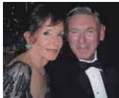
The Crown Family