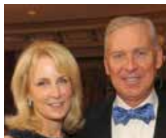
J. Christopher & Anne N. Reyes Foundation