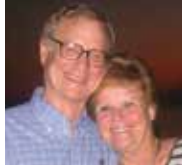
Atkinson Family Foundation