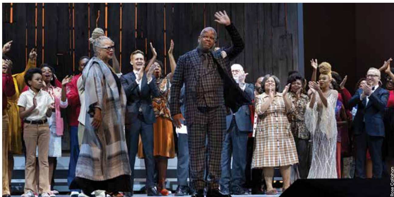
Librettist Kasi Lemmons and composer Terence Blanchard take their bows at the Metropolitan Opera’s opening-night curtain call for Fire Shut Up in My Bones , September 27, 2021.