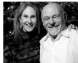
Zell Family Foundation